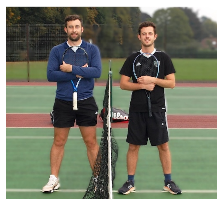
Sunday 22<sup>nd</sup> September 2024

Yesterday was the culmination of our club's summer tournaments with Finals scheduled to take place across all the events (singles, doubles and mixed, plus plate events).